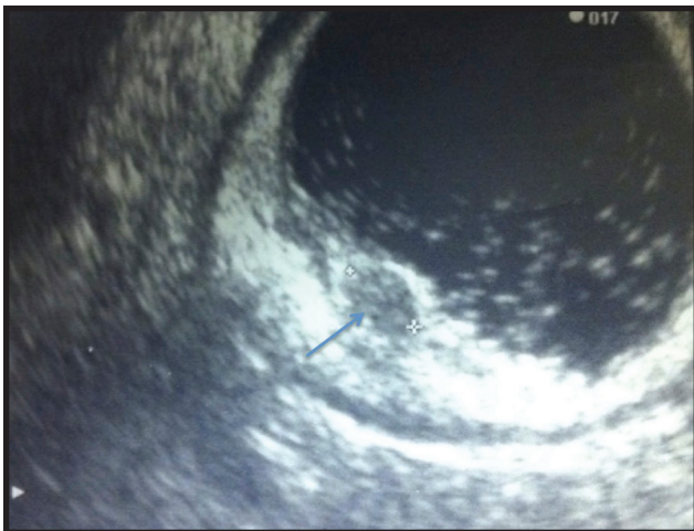
Figure 2. Endoscopic Ultrasound view. Arrow shows a hypoechoic lesion arising off the submucosa layer