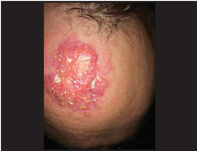
Figure 1. Before Antibiotics