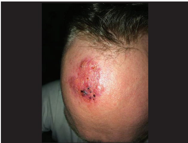
Figure 2. After Antibiotics